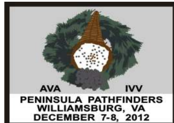
Night Walk Award

AVA SPECIAL PROGRAMS: These walks qualify for the following special AVA programs: America's Bakeries, Celebrating Golden Cinemas, and Honoring Law Enforcement.. For those walking the Virginia Cities Program: Williamsburg.