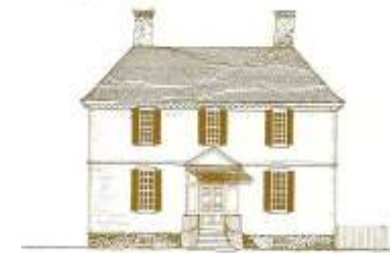
Elkanah Deane House