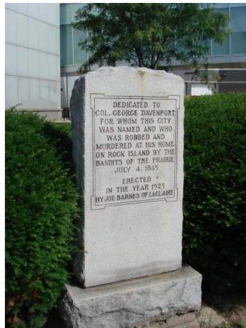
Figure 46: Sunday, June 26, 2011-17th Biennial AVA Convention Walks-Day 9. Today's walk started in Rock Island, Illinois and continued to Davenport, Iowa. Time to go home-lots of wonderful walks and memories!