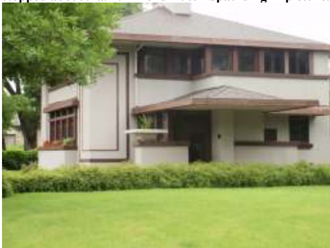
Figure 21: Stockman House: A Frank Lloyd Wright home