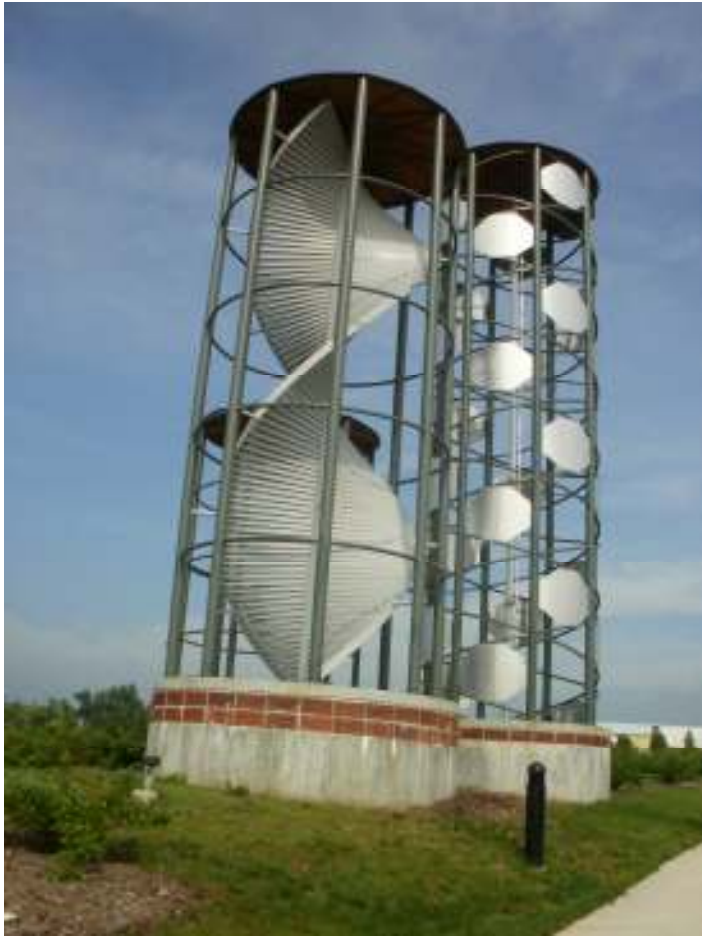
Figure 15: Hybrid Icon (also used for the patch for this walk).