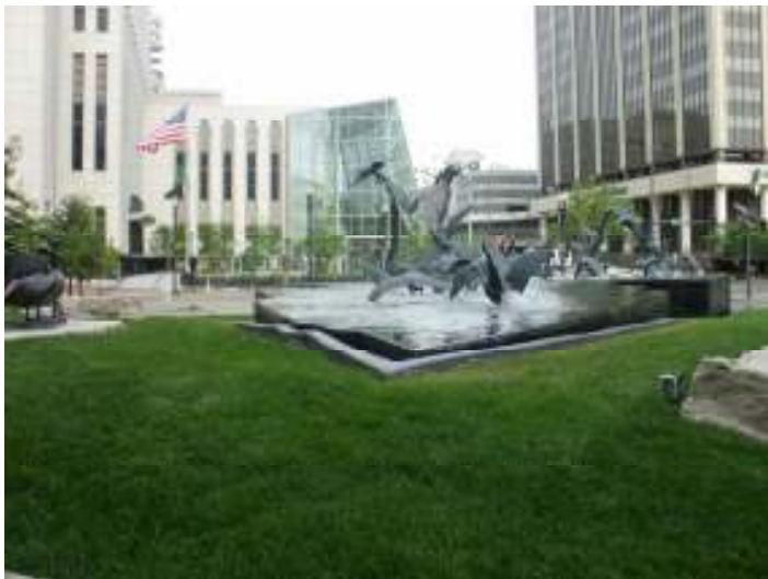
Figure 7: Downtown Omaha