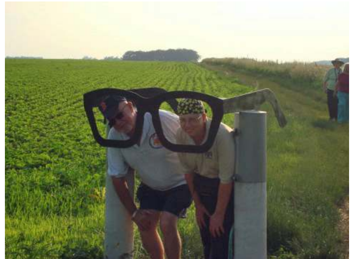
Figure 18: After the White Rock Conservancy walk we drove to Clear Lake, Iowa (about a 2 hour drive) to spend the evening before the two walks the next day. Clear Lake is a resort community but also known as the area for the plane crash that killed Buddy Holly, Richie Valens and the Big Bopper. Sunday evening we drove out to the crash site and memorial (on private farmland).