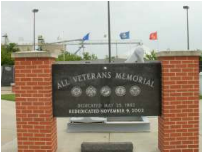
Figure 43: The walk started by walking past the Veterans Memorial.