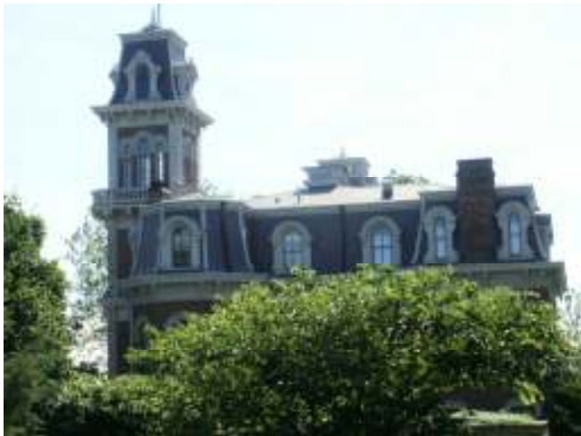
Figure 38: Friday, June 24, 2011-17th Biennial AVA Convention Walks-Day 7. Walk was through downtown Des Moines to include several parks, the Governor's Mansion and several churches. Friday evening was AVA's 35th Birthday Party Dinner.