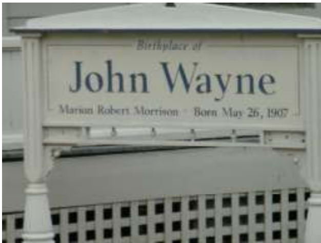
Figure 32: Winterset Iowa is known for being the birthplace of John Wayne.