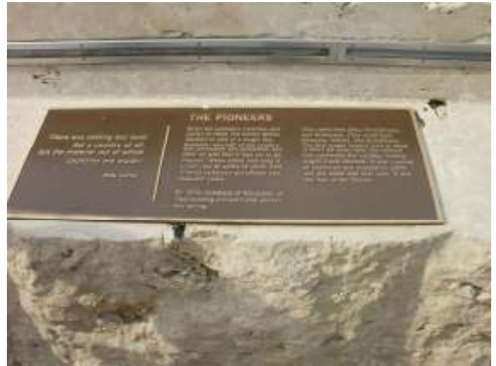
Figure 4: Sign about Pioneers