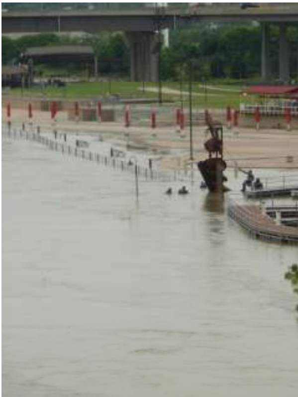
Figure 2: Part of the flooded area-look carefully and you will see heads popping out of the water...they are from a statue that is normally completely above ground.