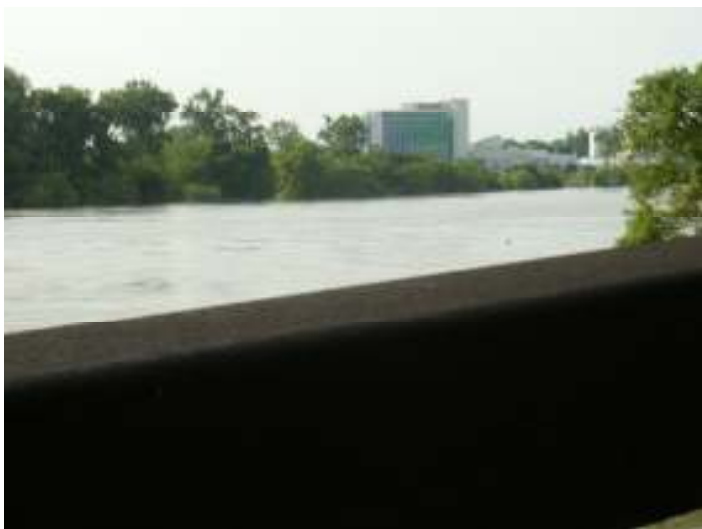
Figure 8: Saturday June 18, 2011--17th Biennial AVA Convention Walks-Day 1 . Two walks to choose from. For both we registered at Harrah's Casino in Council Bluffs, Iowa. Harrah's employee parking lot was underwater! Trails were constantly being revised during the week because

of the flooding. Saturday it poured rain four about 4 hours in the morning. Most people walked (or should I say crawled) the walk at the Hitchcock Nature Center (Loess Hills) first. The nature center is about 15 miles from Harrah's and buses took you to the start point. The trail was rated a 4 (and no one said that it was not AT LEAST a 4!) For those of us used to living and walking at sea level it was a challenge. Ron and I only walked 5 km but it was a TOUGH 5 kms! The trails were very muddy and very steep! Loess Hills are really a unique phenomenon. The layers of loess were deposited thousands of years ago by the glaciers moving through North America. During the Ice Age, the glaciers advanced grinding underlying rock into fine powder-like sediment. This sediment was deposited on the flood plains of the Missouri River. As this dried, the winds picked up the silt and blew it eastward forming the hills.