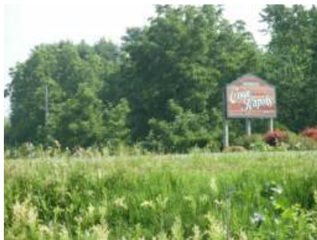
Figure 13: Sunday June 19, 2011--17th Biennial AVA Convention Walks-Day 2. Sunday's walk was at White Rock Conservancy in Coon Rapids, Iowa (about a 90 minute drive from Council Bluffs). Day was hot and humid but it didn't rain while we were walking.