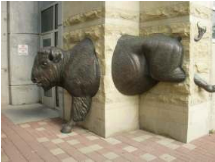
Figure 6: Downtown Omaha