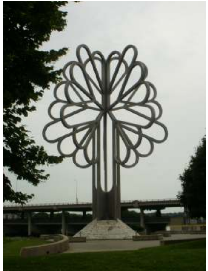
Figure 45: Cedar Rapids' nickname is the "City of Five Seasons". The fifth season is a time to enjoy the other four. The symbol of the five seasons is a Tree of Five Seasons Sculpture that we walked past along the riverbank and it was depicted on the A Award for this walk.