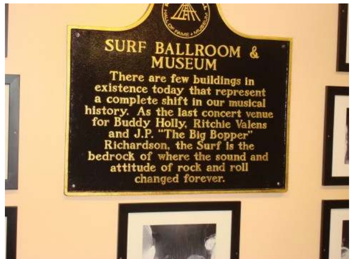
Figure 23: Sign at the start point.