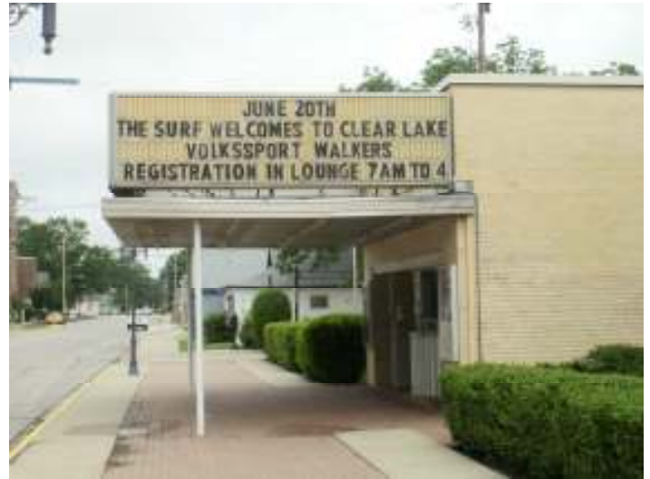
Figure 22: Next walk started at The Surf Ballroom and Museum in Clear Lake, Iowa (about a 20 minute drive from Mason City). There was a nice Welcome Sign!