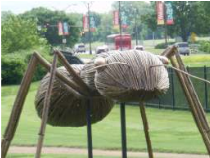
Figure 37: Reiman Gardens is known for having 10 larger-than-life insects on display.