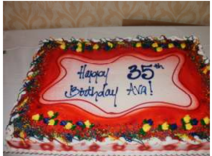
Figure 40: Birthday cake for AVA's 25th Birthday Dinner