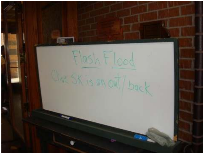
Figure 25: Tuesday June 21, 2011--17th Biennial AVA Convention Walks-Day4. Walk was at Living History Farms in Urbandale, Iowa. It had rained hard most of the night so there was no surprise when we arrived at the start point to see a "Flash Flood" sign changing the trail! We were supposed to have a choice of two trails (one through the town and back and the other through the Living Farm and then part of the town). We enjoyed the trail through the Living Farm and Frontier Town.