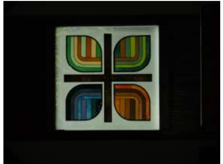
Figure 28: Celebration Symbol that was created as the backdrop for Pope John Paul II's visit to rural American. It was used as the base for the patch for this walk.