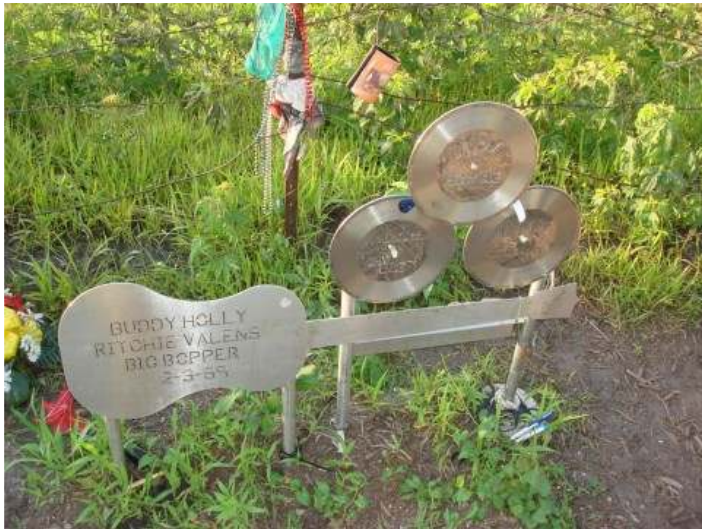
Figure 19: Memorial to Buddy Holly, Ritchie Valens and the Big Bopper. Memorial was not on a trail but we had to stop!