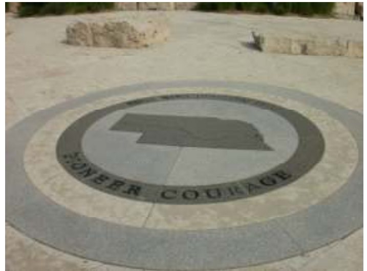
Figure 3: Downtown Omaha--Pioneer Courage