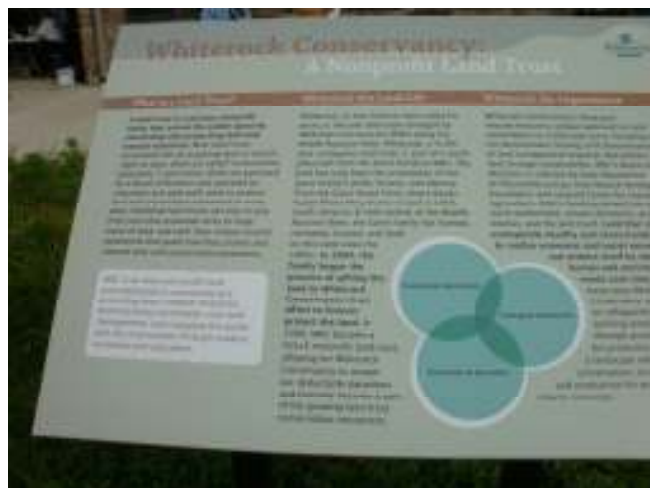
Figure 14: Sign explaining White Rock Conservancy-home of the hybrid seed corn and responsible for introducing it to the Soviet Union during the Cold War.