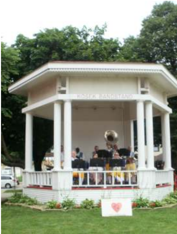
Figure 44: The walk continued through the Czech Village (their bakery had fantastic pastries!). The Czech Plus Band played while we walked. Very entertaining! After walking through the Czech Village the walk continued downtown Cedar Rapids to include Brucemore, a park-like estate built in the 1880s, with a Queen Anne-style mansion, formal gardens, a children's garden, night garden, pond, orchard, and woodland.