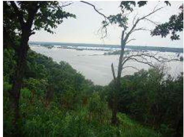
Figure 9: Walk one-View from trail at Hitchcock Nature Center

of the flooding. Saturday it poured rain four about 4 hours in the morning. Most people walked (or should I say crawled) the walk at the Hitchcock Nature Center (Loess Hills) first. The nature center is about 15 miles from Harrah's and buses took you to the start point. The trail was rated a 4 (and no one said that it was not AT LEAST a 4!) For those of us used to living and walking at sea level it was a challenge. Ron and I only walked 5 km but it was a TOUGH 5 kms! The trails were very muddy and very steep! Loess Hills are really a unique phenomenon. The layers of loess were deposited thousands of years ago by the glaciers moving through North America. During the Ice Age, the glaciers advanced grinding underlying rock into fine powder-like sediment. This sediment was deposited on the flood plains of the Missouri River. As this dried, the winds picked up the silt and blew it eastward forming the hills.