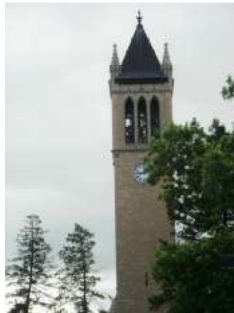
Figure 35: Iowa State University is known for its Bell Tower and several Grant Wood Murals.