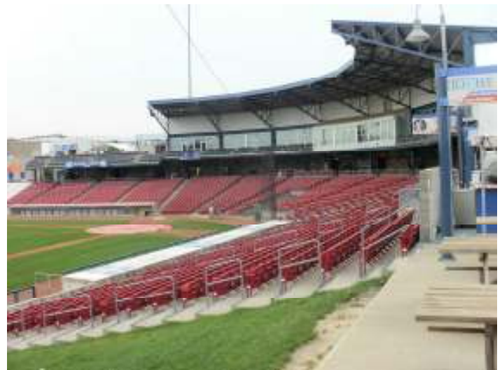
Figure 42: Saturday, June 25, 2011-17th Biennial AVA Convention Walks-Day 8. Today's walk started in Cedar Rapids, Iowa at Veteran's Memorial Stadium, home to the Cedar Rapid Kernels, a Class A affiliate of the Los Angeles Angels.